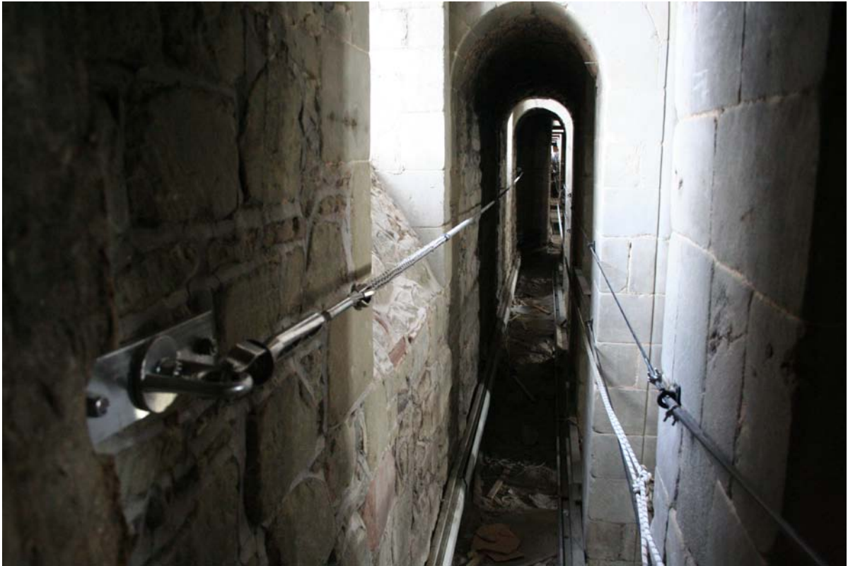
Uni16 lifeline running the length of the high level clerestory.

Vertical Technology undertook a detailed assessment of the structure and associated risks, appraisal of fixings and careful calculation resulted in the selection of the unique Uni16 synthetic cable lifeline.