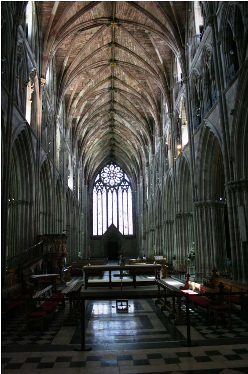
High level clerestories and triforiums around the Nave, Worcester Cathedral.

As a busy cathedral it was essential to keep disruption to an absolute minimum while ensuring the safety of our installation team.