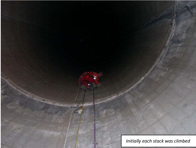
Initially each stack was climbed

With a tight shift period the team worked in difficult location to complete the contract on time and within budget.