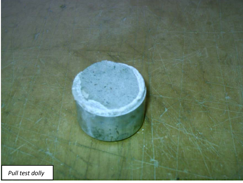
Pull test dolly