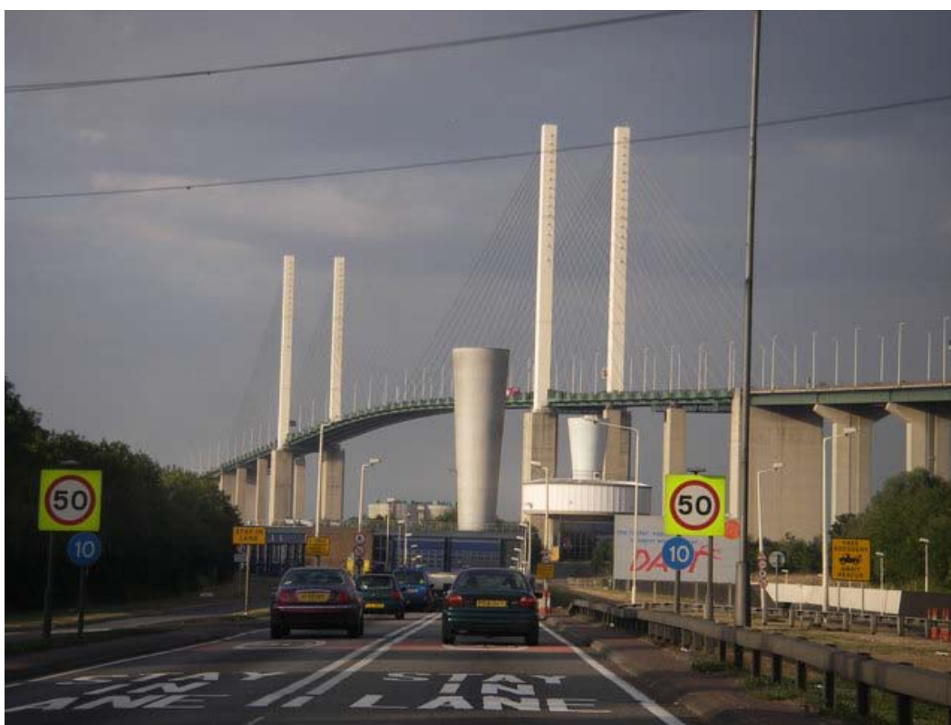
The conical Kent side ventilation stack

Undertake extensive concrete repairs to the inner surface of the two ventilation stacks for the Dartford Crossing Tunnel at night, removing all access equipment after each shift to ensure the extraction fans could operate during the day. The top was inaccessible by MEWP and previous works employed a large crane and man riding basket.